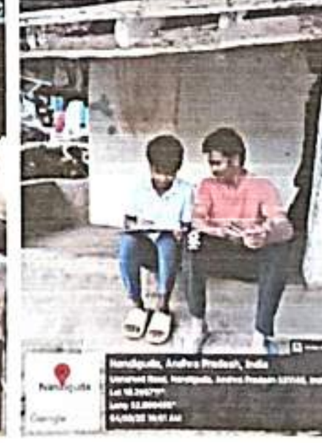
Navigata Vishakhapatnam, Andhra Pradesh, India Linnamed Road, Vishakhapatnam 531145, India Lat 16.266667° Long 82.891667° 9/12/22 10:23 AM