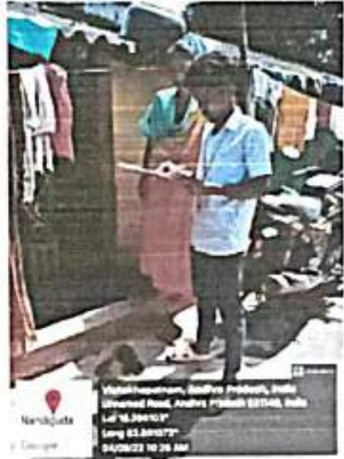
Navigata Vishakhapatnam, Andhra Pradesh, India Linnamed Road, Vishakhapatnam 531145, India Lat 16.266667° Long 82.891667° 9/12/22 10:28 AM