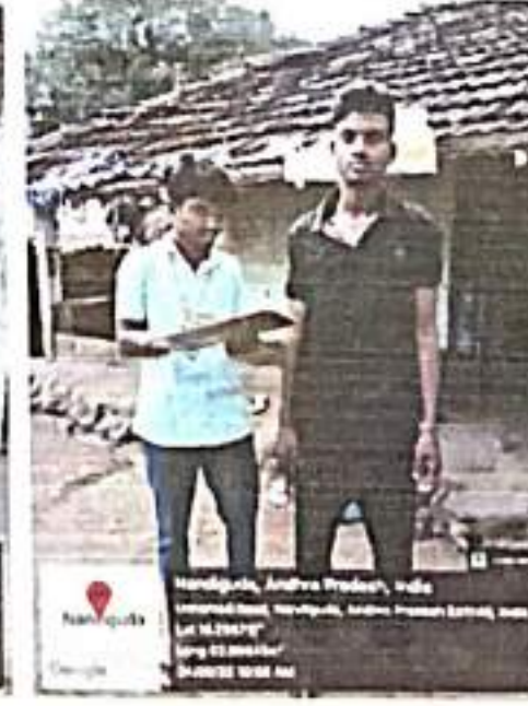
Navigata Vishakhapatnam, Andhra Pradesh, India Linnamed Road, Vishakhapatnam 531145, India Lat 16.266667° Long 82.891667° 9/12/22 10:23 AM