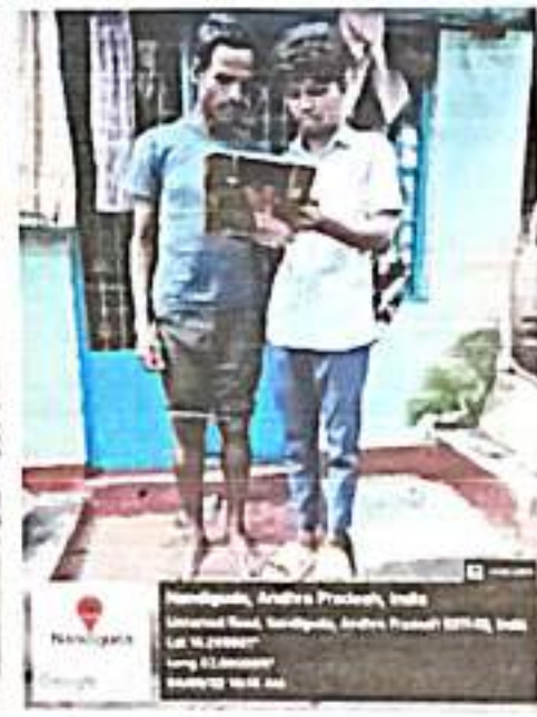
Navigata Vishakhapatnam, Andhra Pradesh, India Linnamed Road, Vishakhapatnam 531145, India Lat 16.266667° Long 82.891667° 9/12/22 10:23 AM