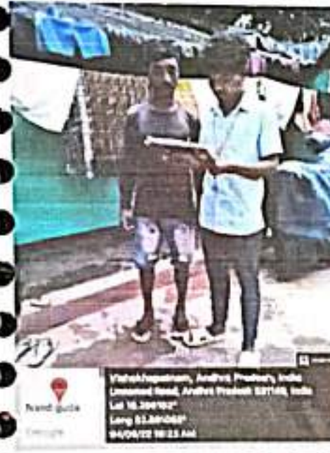
Navigata Vishakhapatnam, Andhra Pradesh, India Linnamed Road, Vishakhapatnam 531145, India Lat 16.266667° Long 82.891667° 9/12/22 10:23 AM