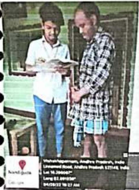
Navigata Vishakhapatnam, Andhra Pradesh, India Linnamed Road, Vishakhapatnam 531145, India Lat 16.266667° Long 82.891667° 9/12/22 10:27 AM