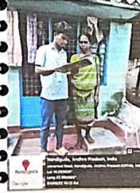
Navigata Vishakhapatnam, Andhra Pradesh, India Linnamed Road, Vishakhapatnam 531145, India Lat 16.266667° Long 82.891667° 9/12/22 10:23 AM