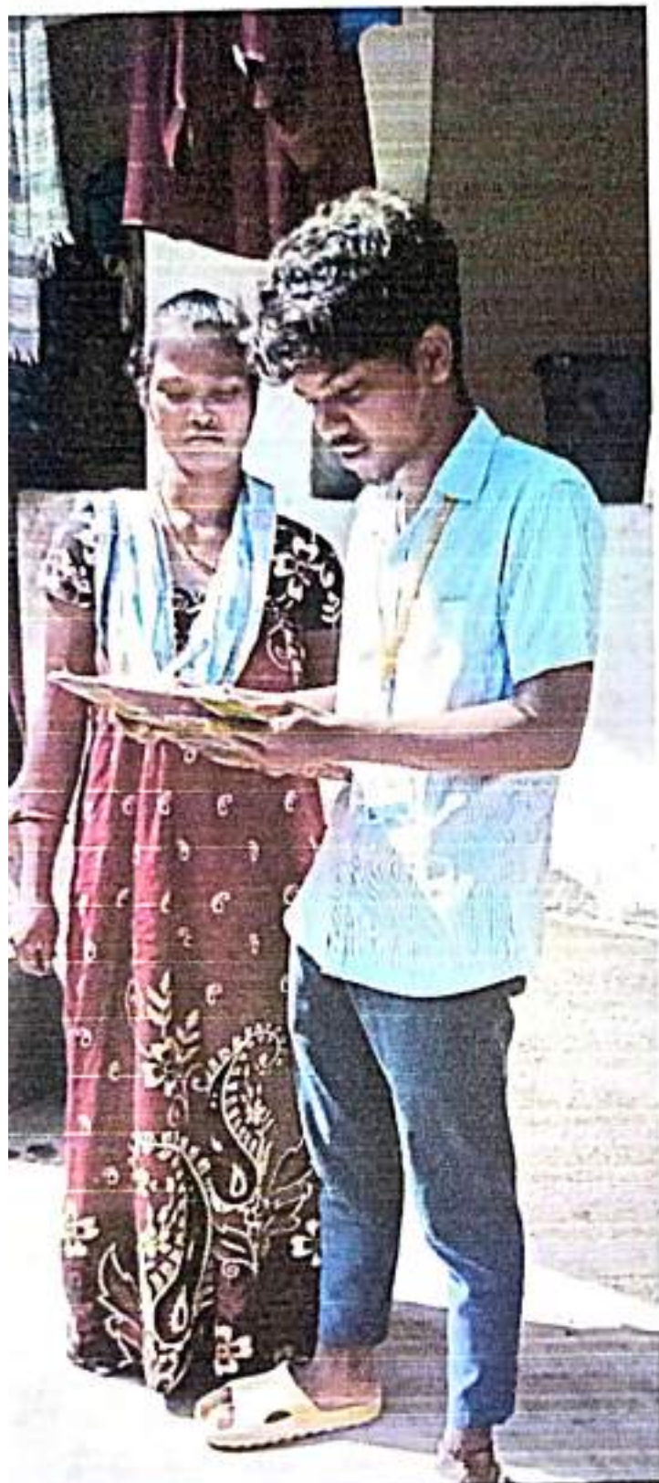
Nandiguda, Andhra Pradesh, India 7VXQ+FQ, Nandiguda, Andhra Pradesh Lat 18.296605° Long 82.89018° 04/09/22 09:24 AM